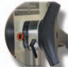
Clutch Depth Stop