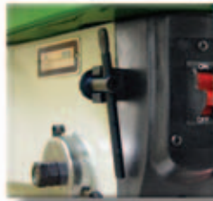
Convenient Chuck Key Holder