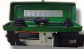
Speed Selection Chart