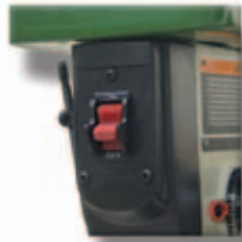
Toggle Safety Switch