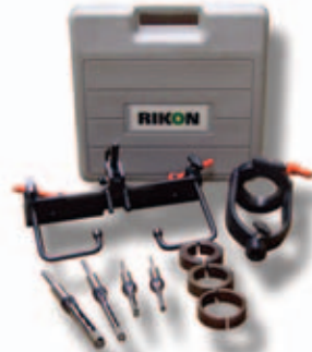
Mortising Attachment w/ 4 Chisels