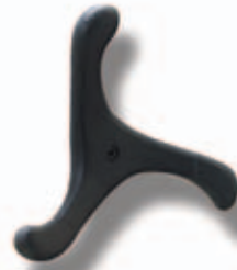
Solid Cast Iron Handles