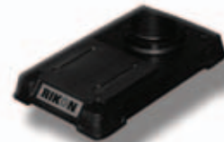
Rugged Cast-Iron Base