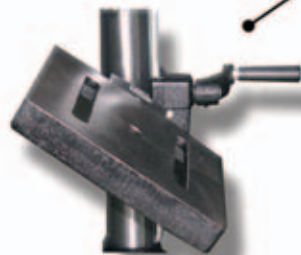
Table Rotates 360° Tilting Table