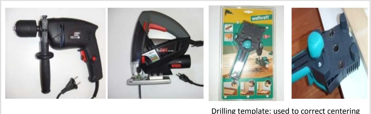
Variable speed drill